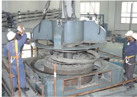
Dismantling of Coolant Pump Rotor.

Another significant milestone was installation of indigenized Loose Parts Monitoring System (LPMS), meant to provide early warning of degradation within pressure boundary due to stray or loose parts therein. This remained a long standing Regulatory requirement since early 90s'. It was indigenously designed, assembled, tested and installed besides significant fabrication and software development