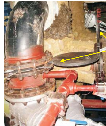
Spectacle Flange Joint for Dual Operation Modes of COW-HX3.

After modification in piping, configuration of COW-HX3 for its dual operation modes, the estimated saving will be Rs. 50 million/year.