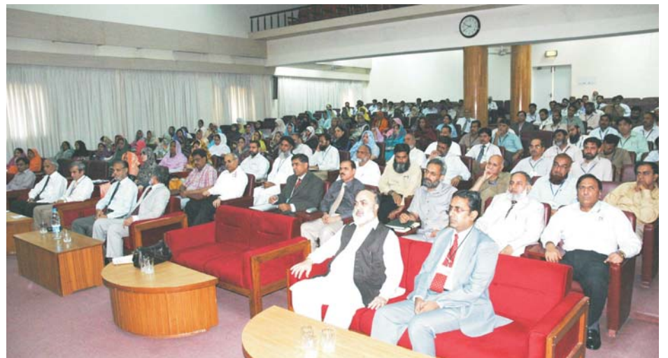
Teachers from PAEC Schools and Colleges and PIEAS Faculty Members attending the inaugural session of Teachers Training Course at PIEAS.

It may be recalled that PAEC is running a network of educational institutions from nursery to college level at its projects for the children of its employees.