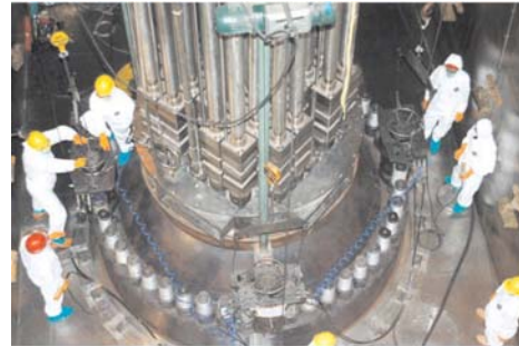
Detentioning of studs for lifting of Reactor Pressure Vessel Head.