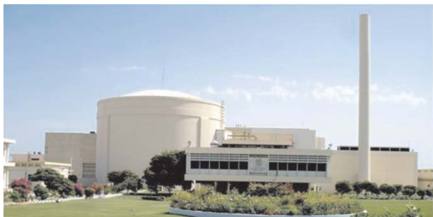
A view of Kanupp.

This landmark was achieved through sincere efforts and hard work of KANUPP production and engineering support divisions. Timely guidance and foresight of the management also played a pivotal role in achieving it. As a gesture of appreciation, sweets were distributed among the employees to celebrate this significant