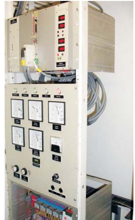
PLC based Neutron Instrumentation System of KANUPP (NISK)

equipment, the full-scale replacement consisting of Log Amplifier, Linear amplifier, Period amplifier, Trip Test circuitry, Normalizer/ Compensator, Trip logic, intermediate Trip relays, Indicators and switches has been successfully implemented at Protective Channel 'C'. The plant is