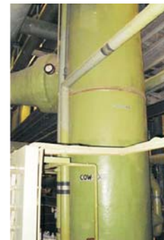
Condensate Water Heat Exchanger #3 (COW-HX3).