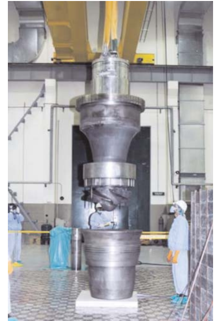
Removal of Protective Shroud of Reactor Coolant Pump Rotor.

by engineers and scientists from DNPER, HMC-3 and C-1.