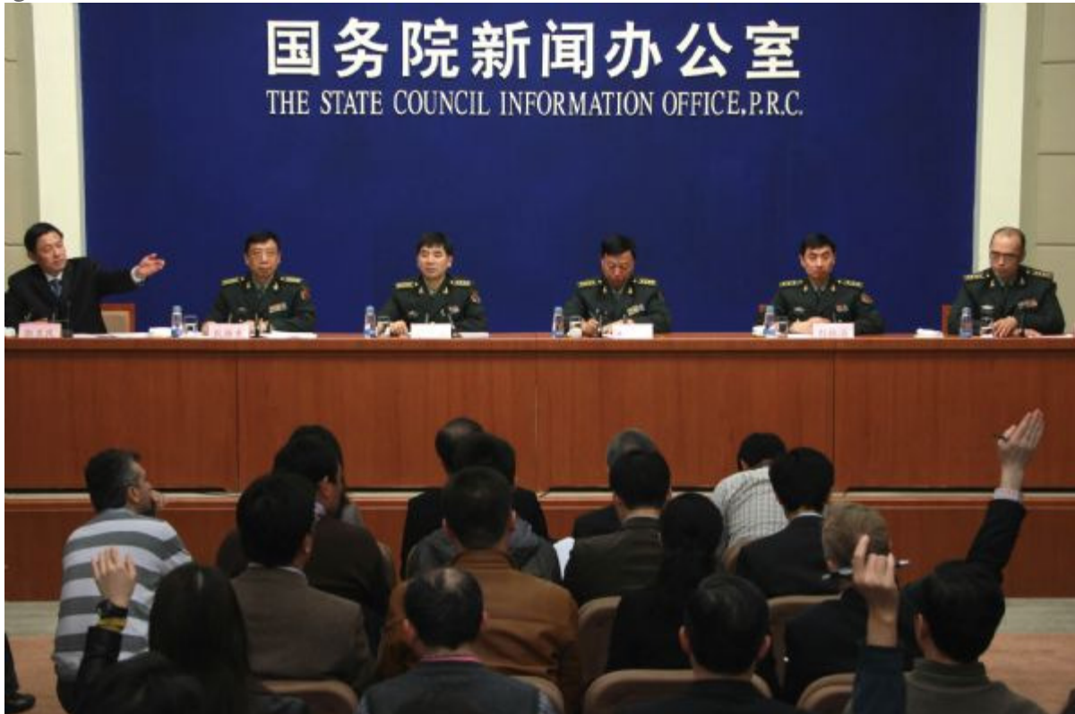
Officers including spokesman with China's Ministry of National Defense Geng Yansheng (2nd L) prepare to answer questions at a press conference in Beijing, capital of China, March 30, 2011. The Chinese government issued the white paper on China's national defense in 2010 on Thursday, which reiterates China's insistence on peaceful development and pursuit of a national defense policy that is defensive in nature.

BEIJING, March 31 (Xinhua) -- The Information Office of China's State Council on Thursday issued a white paper titled "China's National Defense in 2010". Following is the full text of the document: